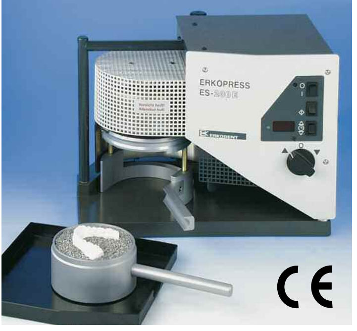
Full pressure dental thermoforming machine with interfaced timer