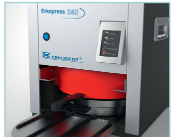
Forming in progress