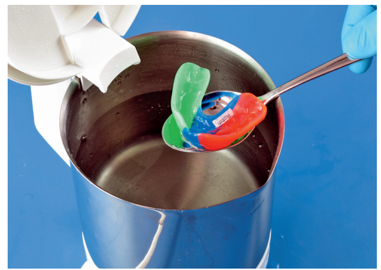
2. Take it out with the help of a spoon or similar.