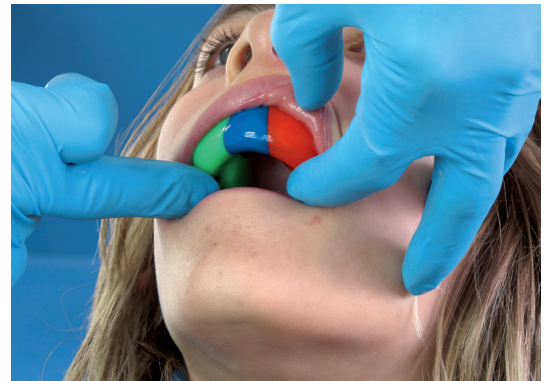
6. Push the guard upwards with little power.