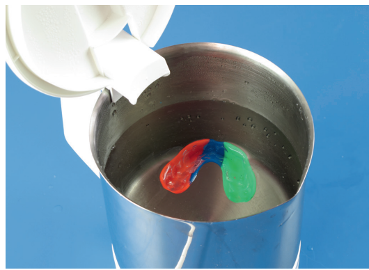
1. Put the mouthguard for 10 - 15 seconds into water at boiling temperature.

Each readaptation will slightly thin the guard, therefore it is recommended to readapt the guard not more often than five times.