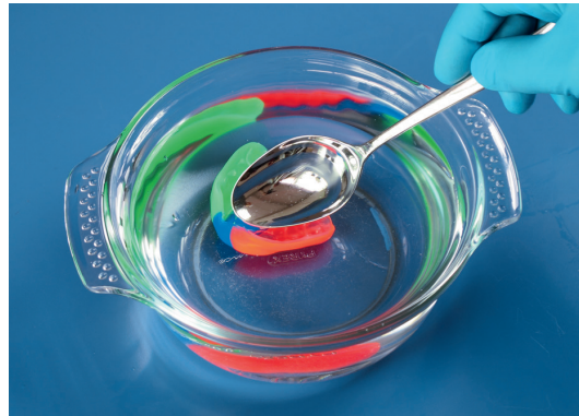
3. Briefly (max. 2 sec.) drown the guard under cold water.