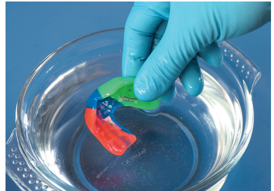
4. Now the surface is cold enough to take the guard in the hands and...